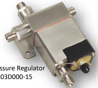
Oxygen Pressure Regulator P/N: F103D000-15

Qualified for use, the high pressure oxygen regulator is used as OEM equipment on the P-3 Orion Maritime Surveillance Aircraft.