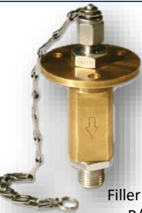
Filler Valve Manifold P/N: B42782-1

Eaton's Filler Valve Manifold is an integral component in military aircraft oxygen life support systems. The filler valve interfaces with the oxygen system to allow controlled recharging of the oxygen storage vessels.