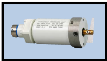
Wheel Speed Transducer P/N 140-279 NSN 1630-01-525-3372