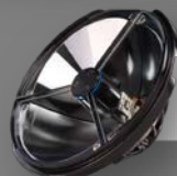
PAR 64 Landing Light 751-1005-001